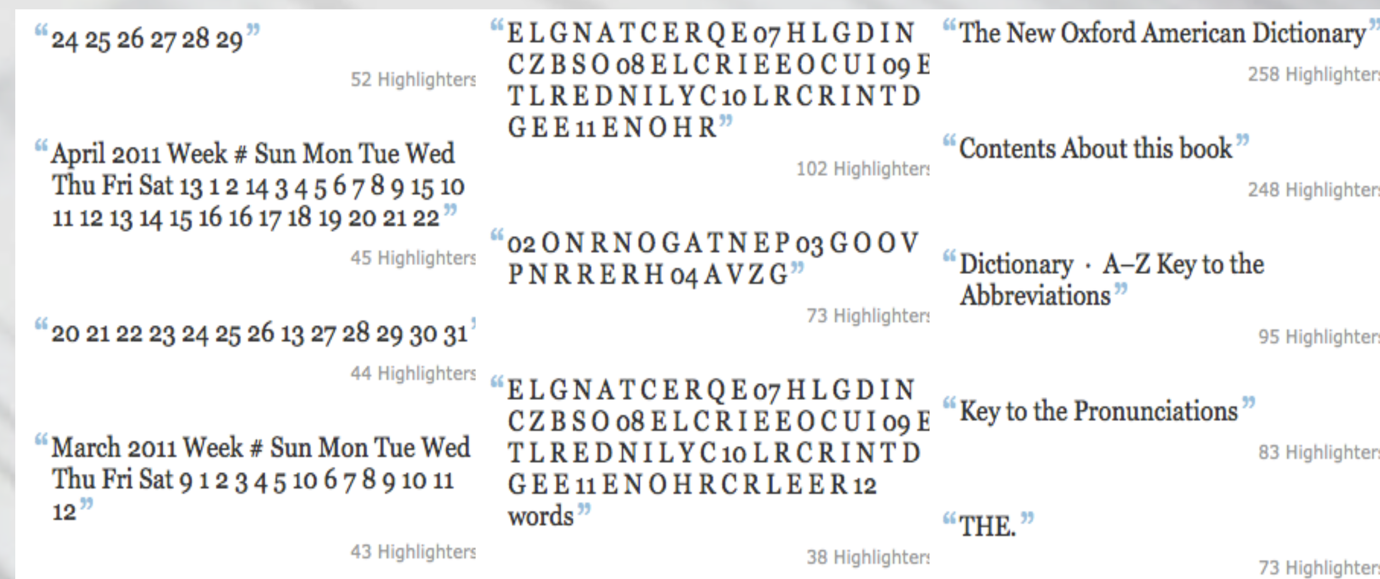
Figure 2. Atypical Highlights